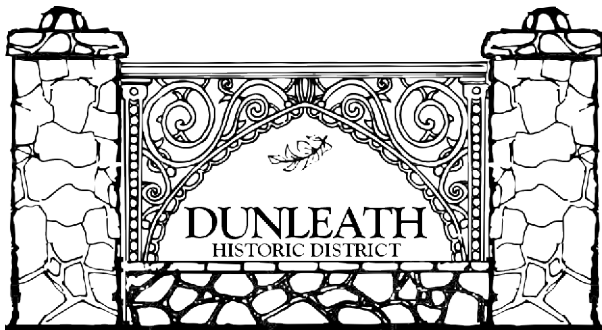
rendering of the monument sign

In December and January the board worked with landscape architect Randal Romie to develop designs for signature gateway features and pedestrian archways at important locations around the neighborhood. We've approved preliminary designs that incorporate red-toned quartz stone, rope mortar joints, a pecan spring logo, and decorative ironwork, with the Dunleath Historic District name prominently displayed. The stone was selected because it is similar to that on the retaining wall remnants of the Dunleath property behind the Community Garden, and the ironwork patterns are based on wrought iron arches at the original entrance to the Dunleath mansion. The pecan sprig was chosen because our neighborhood was reportedly once a pecan grove, and there are still many "volunteer" pecan trees all through it. Once the designs are finalized, we will start seeking permission to install them at strategic locations. 🍌